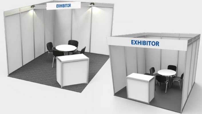
Exhibit space, shell scheme – white walls with aluminium frame, grey carpet, an information counter, a table with 4 chairs, spotlights, a trash can, name board, power supply up to 2kW, daily stand cleaning

CORNER PACKAGE 20 m 2 Discounted price: 5 800 EUR